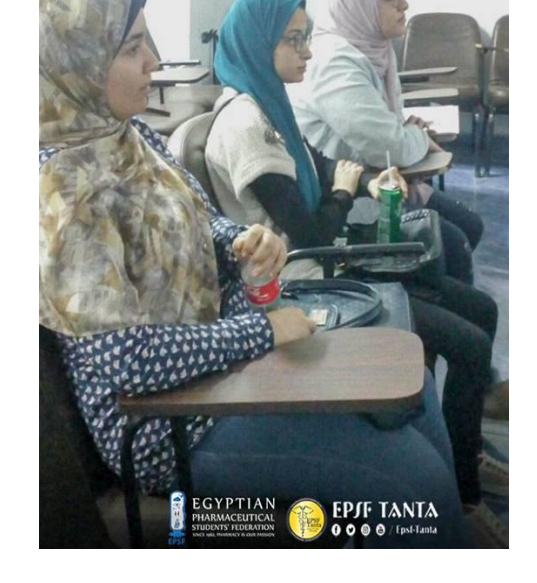
Y- English Club